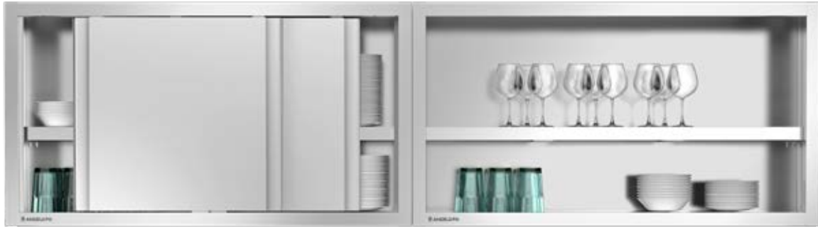
Models with LED lighting available