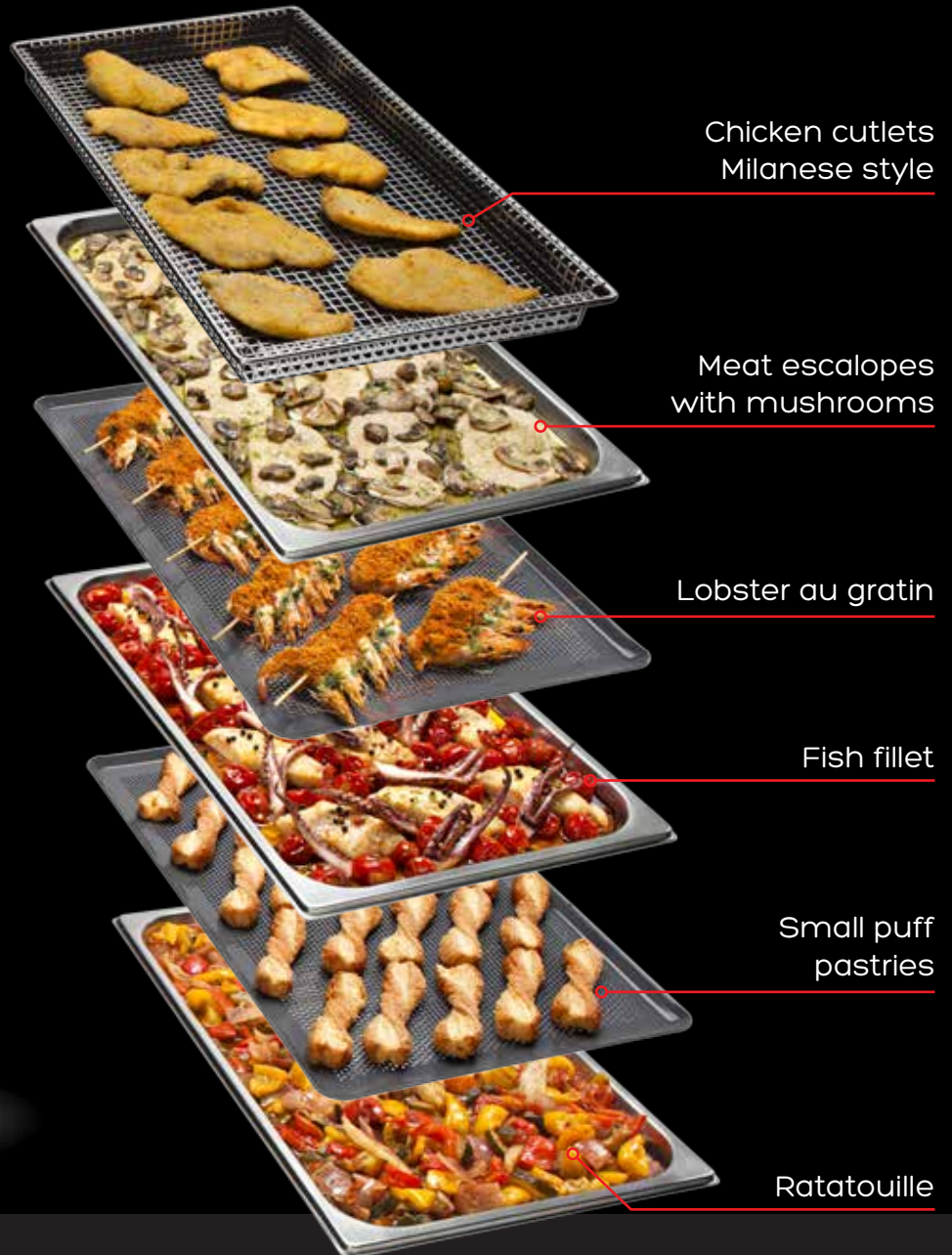
Chicken cutlets Milanese style