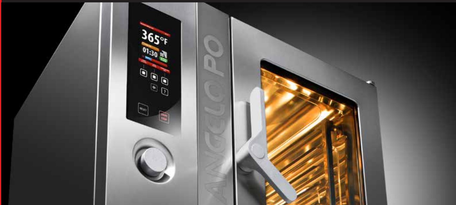
Multi Function Combi Oven